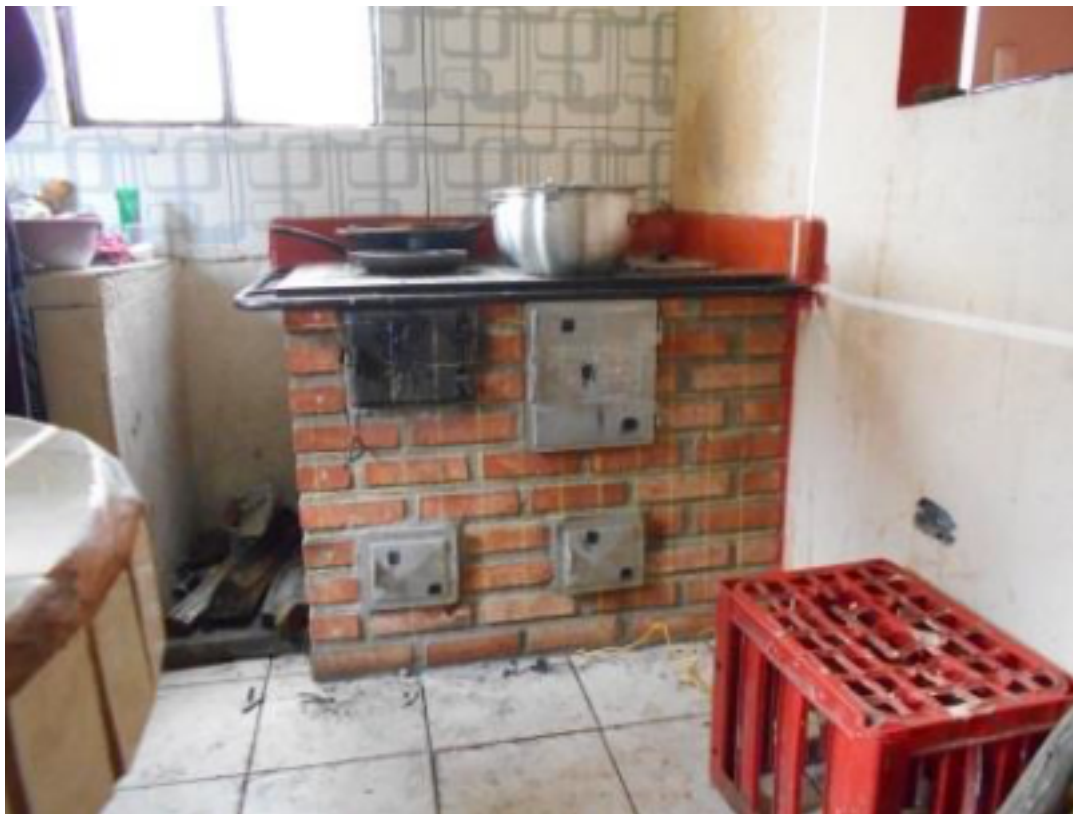
Figure 1 Plancha stove

In this research paper, a plancha stove has been compared to a traditional "grill" stove using four tests. The protocols followed corresponded to the four tests carried out, namely the water boiling test (WBT 4.2.3), the biomass stove safety protocol (BSSP 1.0), the controlled cooking test (CCT 2.0) and the kitchen performance test (KPT 2.0) for studying the behavior of both the stoves. All tests were performed in Pucará, an Ecuadorean indigenous community located at 3106 m.a.s.l. Local available eucalyptus fuelwood was used. The thermal measurement was done using three thermohigrometers and an infrared thermometer. Figures 1 and 2, show the tested woodstoves.